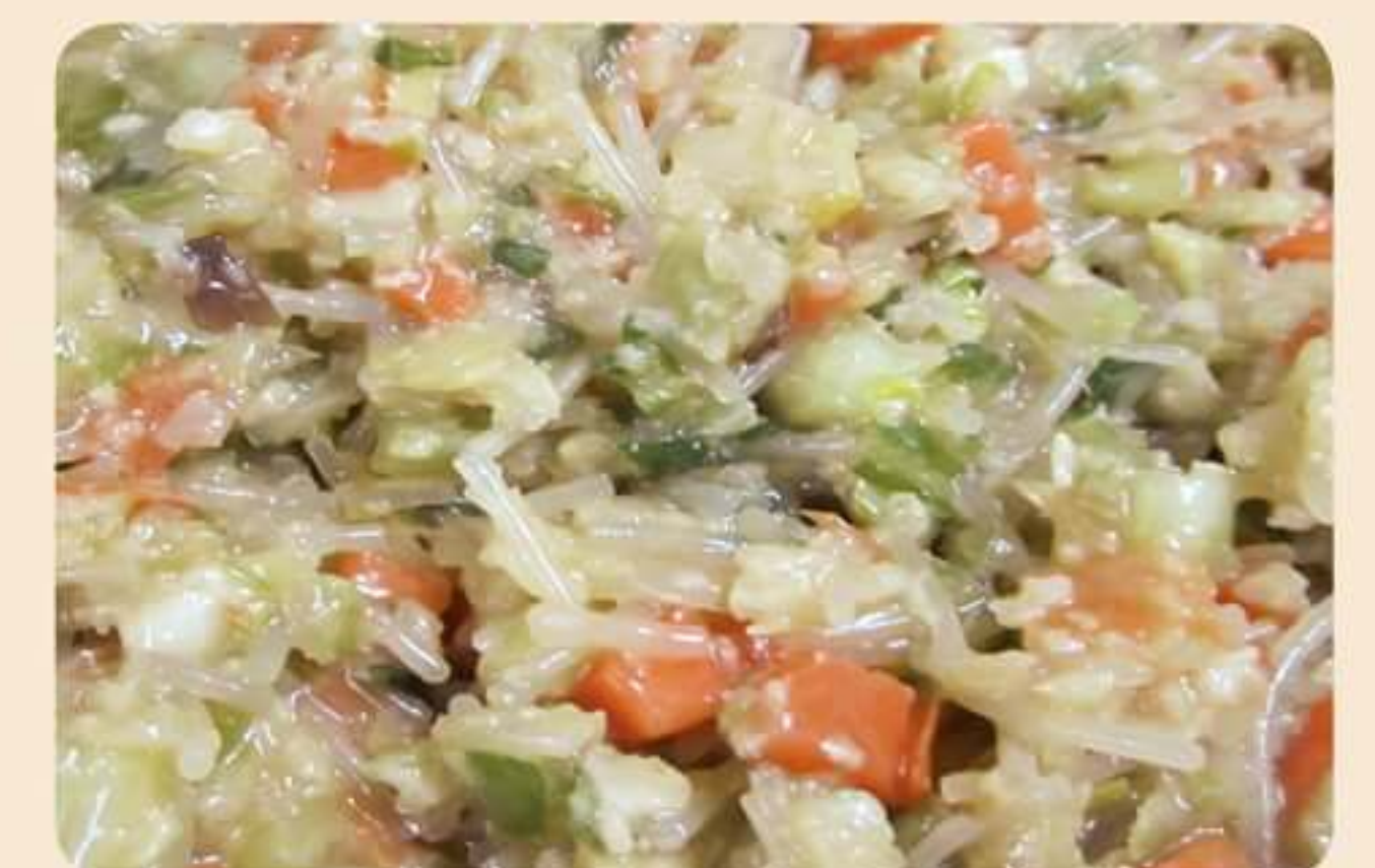
Vermicelli and Vegetable