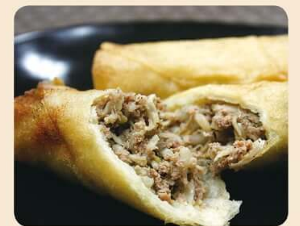
Bean Sprout, Vegetable and Beef