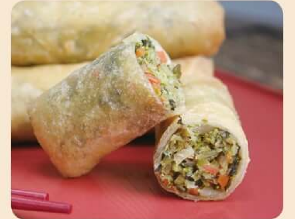
Vegetable and Meat